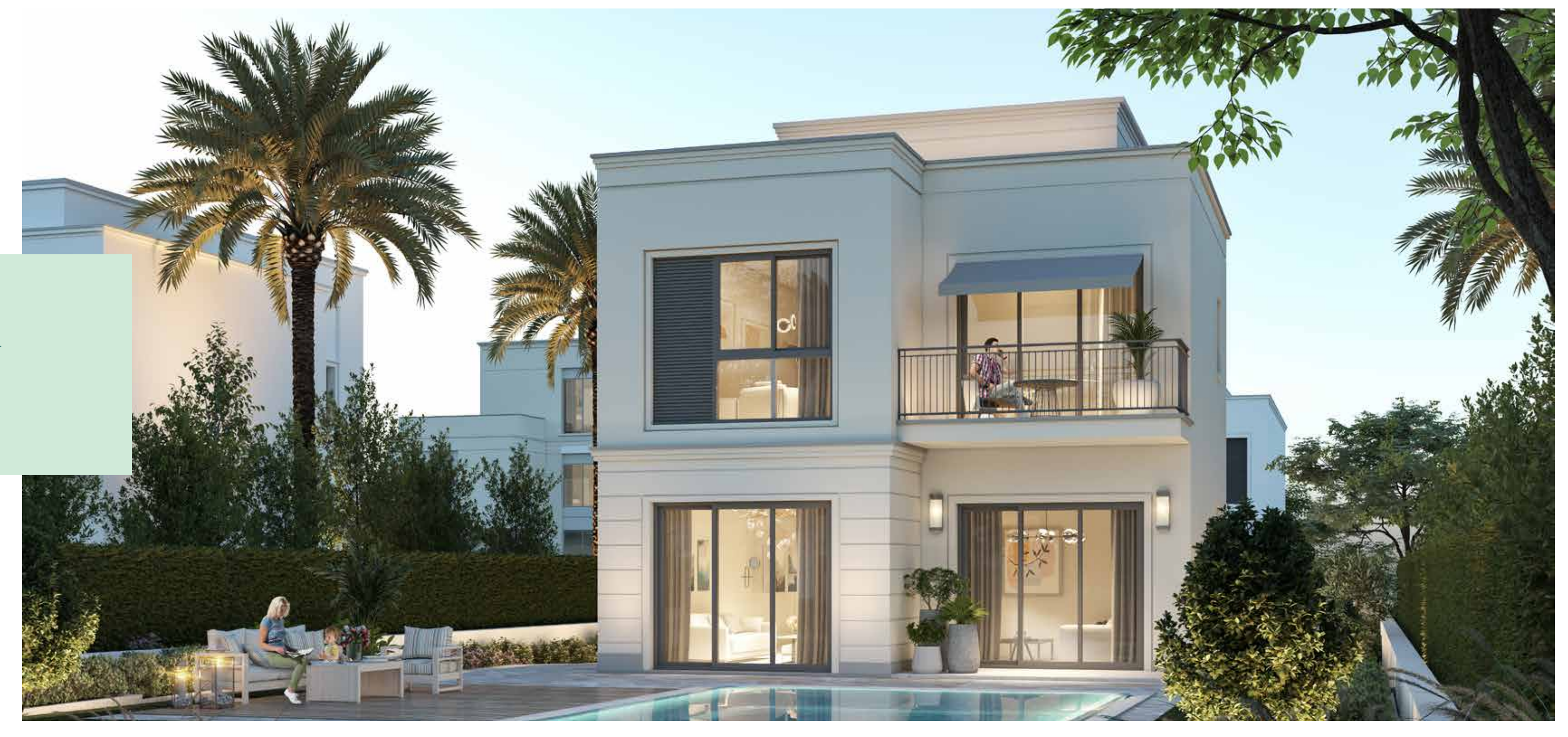
GARDEN VILLAS · BELLE VIE · NEW ZAYED