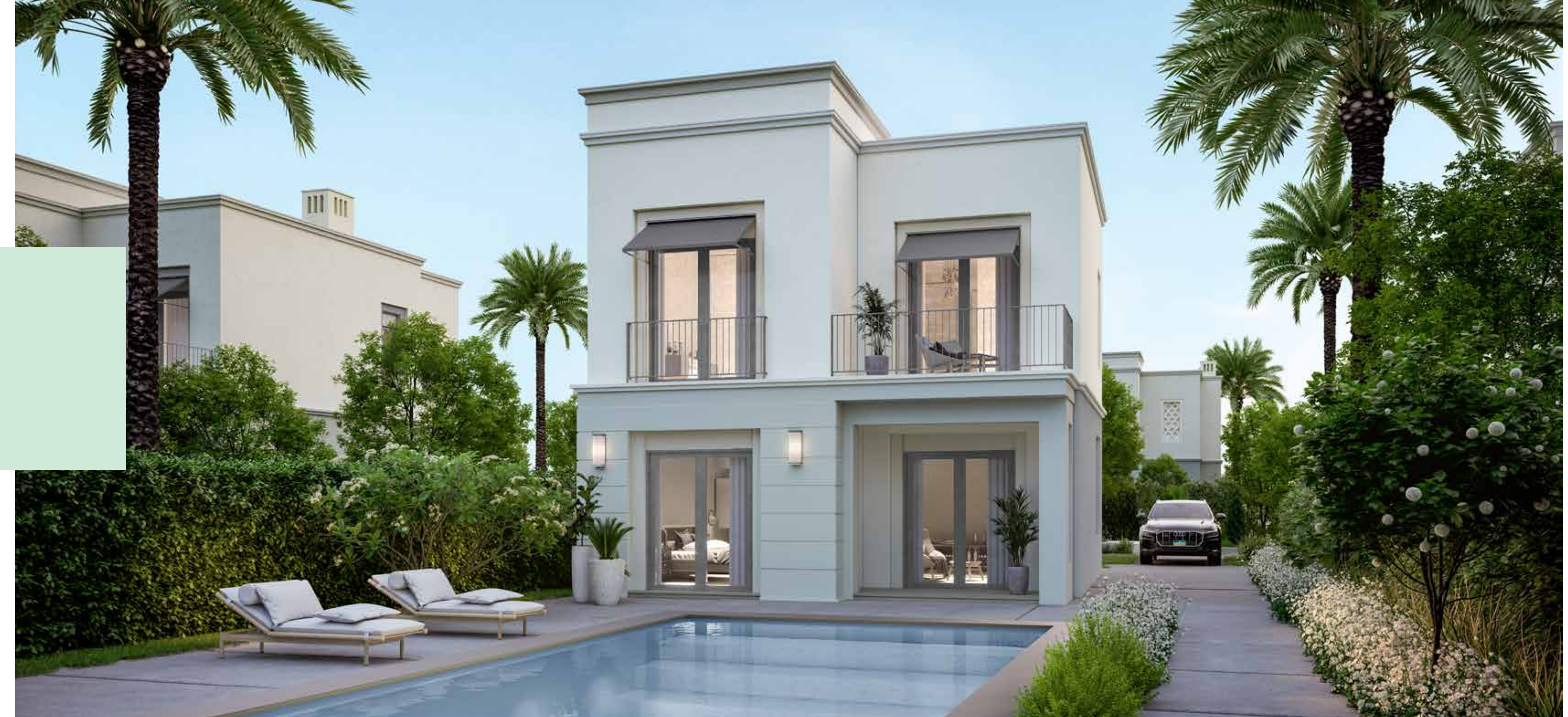
GARDEN VILLAS · BELLE VIE · NEW ZAYED