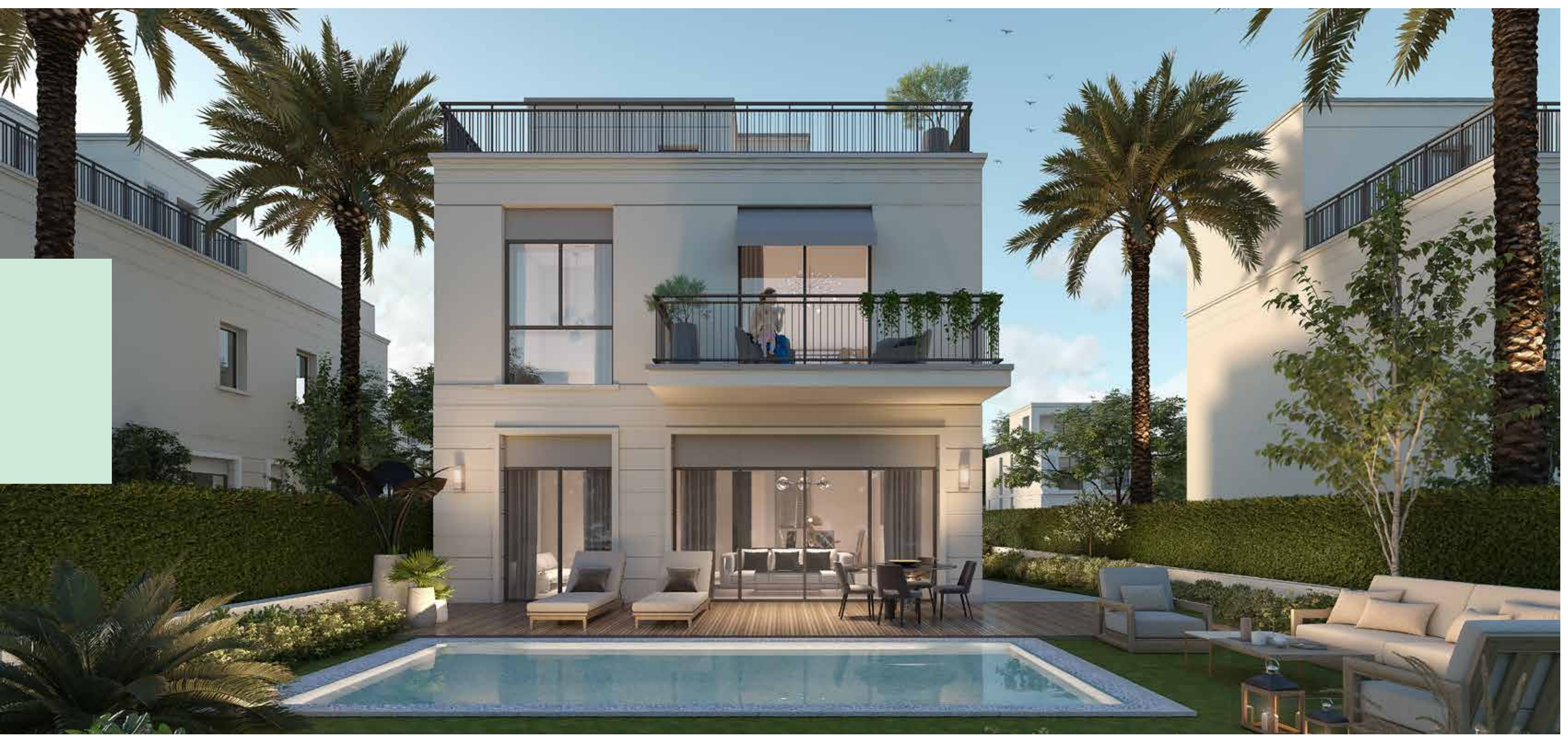
GARDEN VILLAS · BELLE VIE · NEW ZAYED