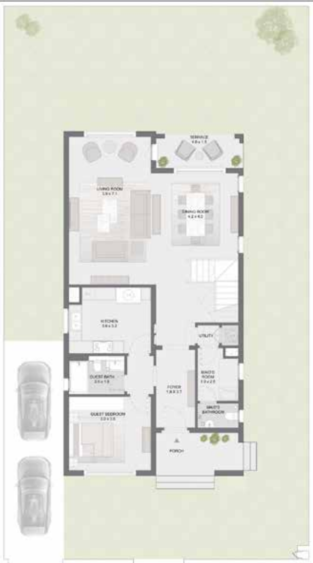
GROUND FLOOR LEVEL

1. All room dimensions are measured to structural elements and exclude wall niches and construction tolerances. 2. All dimensions have been provided by our consultant architects. 3. All materials, dimensions and drawings are approximate, information subject to change without notice. 4. Actual areas may vary from the stated area. Drawings not to scale. The developer reserves the right to make revisions without prior notice. 5. Actual unit areas, front windows, porches, terraces, loggia and exterior trim detail may vary by elevation styles and or level.