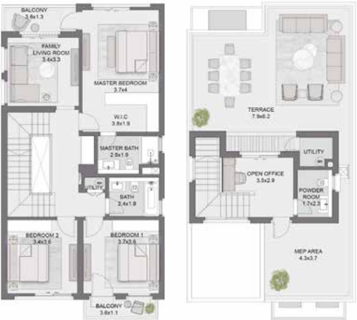
FIRST FLOOR LEVEL