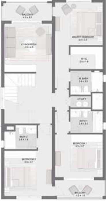
FIRST FLOOR LEVEL