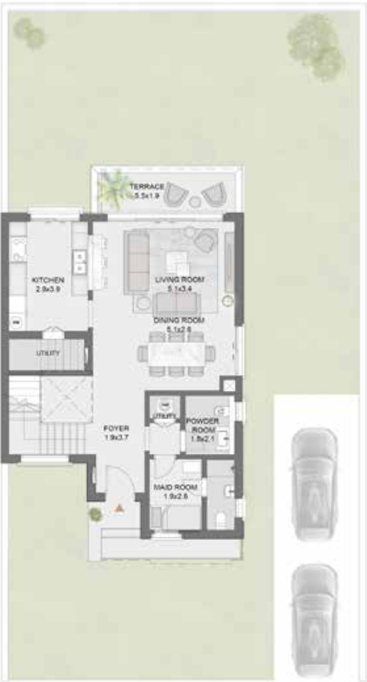
GROUND FLOOR LEVEL