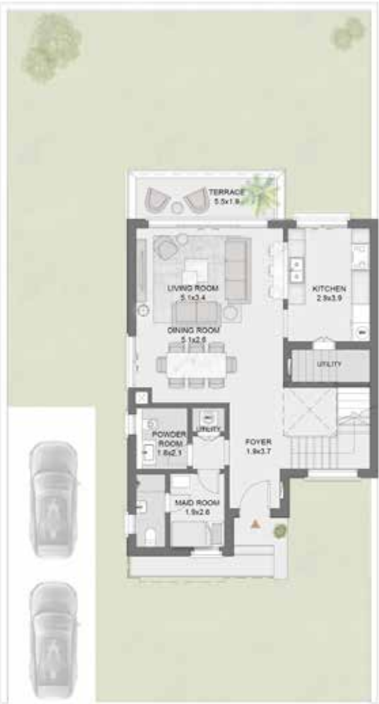
GROUND FLOOR LEVEL

DISCLAIMER 1. All room dimensions are measured to structural elements and exclude wall niches and construction tolerances. 2. All dimensions have been provided by our consultant architects. 3. All materials, dimensions and drawings are approximate, information subject to change without notice. 4. Actual areas may vary from the stated area. Drawings not to scale. The developer reserves the right to make revisions without prior notice. 5. Actual unit areas, front windows, porches, terraces, loggia and exterior trim detail may vary by elevation styles and or level.